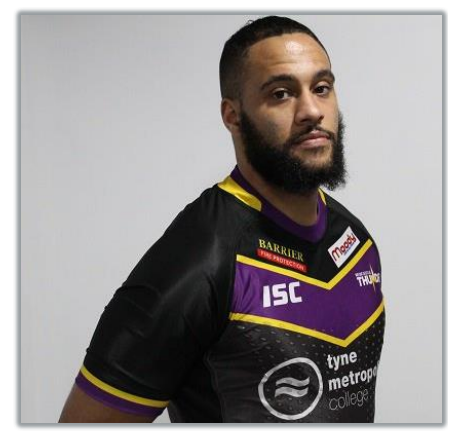
Newcastle Thunder 2018 strip

successful business and as a Thunder supporter."