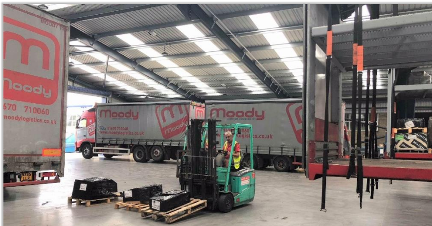
Paul Tweddle loading pallets in the cross-deck ready for the night trunks

In June we opened our cross-deck facility's roller shutter doors to welcome the first night trunks in to offload as the extension sprang into action.