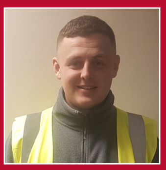
What is your role in the business? Warehouse to Wheels Apprentice

What's better: certificates or experience? Experience